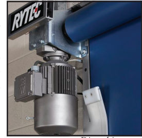
Direct drive motor