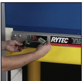
Automatic sleep mode extends battery life.