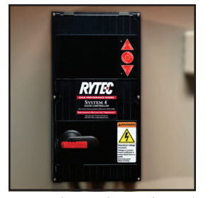
System 4 shown with optional rotary disconnect